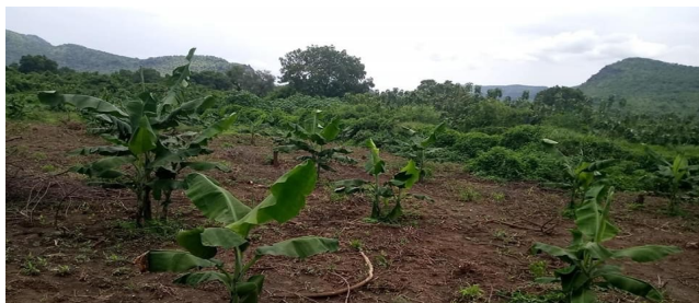
The extended acreage of banana plantation 2020