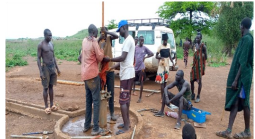
Repair of one of the community boreholes