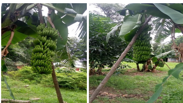
Some of the banana trees with bunches for maturity