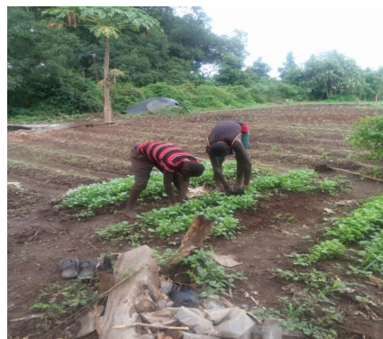
Some of the students learning vegetable crops production during this lockdown.

380 banana suckers have been transplanted in the new plot. This is to enhance local income for Peace Village, food for consumption and empower the local community within the Kuron catchment area to adopt perennial crops such as bananas in their own plots. Some families have planted banana suckers in their homes and others have started harvesting. Many have shown interest and have requested for suckers for transplanting at their plots. With the heavy rains of July, there is high hope that it will pick up very fast.