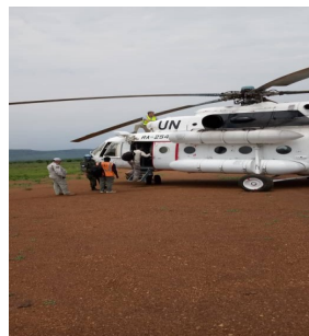
The visit of the UNMISS and the completed building, awaiting to be handed over to Holy Trinity Peace Village in the month of August.

Before completion, UNMISS visited the work twice to ensure that the work is finished in time before schools reopens and handing over to Holy Trinity Peace Village— Kuron