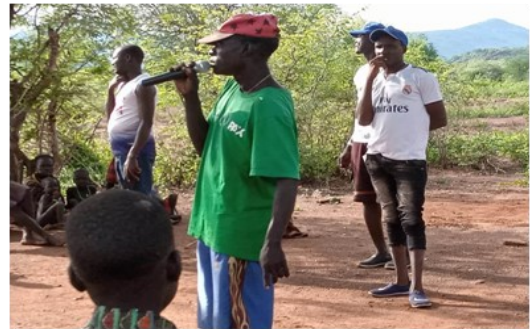
Moruethe Boma chief joined the health volunteers in speaking to his subject, thanking HTPV for having repaired their borehole, for they are able to practice hand washing with clean water

This activity aimed at increasing access to hand washing facilities at household level for every homes using five liters jerry cane. This was conducted for Napil and some staff built-up communities. There were 26 households hand washing tip tap facilities Established.